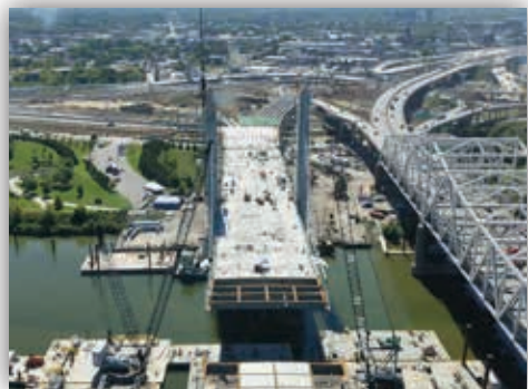
The downtown bridge project in Louisville, Kentucky.

Other ongoing work in District 3 includes the following: Sullivan & Cozart's work on the downtown Louisville parking garage. This project is running on schedule