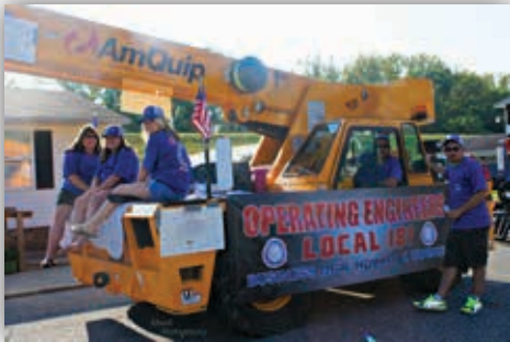
2015 Catlettsburg Labor Day Parade.

By the time you receive the newsletter, the MAP turnaround project should have begun on October 5 th . Two 7-10 hour shifts are scheduled for 38 days utilizing 80 or more operators. Most of the civil work will slow down during the 38 day period, but we hope it will pick back up after the turnaround