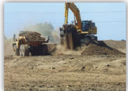
Fisher Contracting moving dirt at Toyota in Georgetown, Kentucky

The work at the Toyota Plant in Georgetown is continuing to be performed under a Project Labor Agreement with several contractors. The National Building Trades and Toyota have extended the PLA to all new work at TMMK. Toyota has proposed several projects to come in the next few years. Toyota and several contractors have