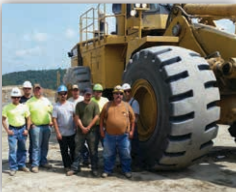
Local 181 members at the Cape Sandy stripping project.

If we can be of assistance, stop by the office or call 812-474-1811. ♦