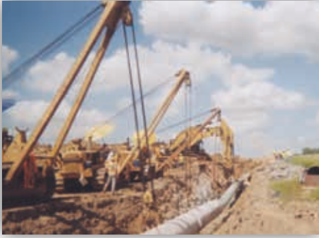
Welded Pipeline take up and relay in Madison County, Kentucky

started requiring 10-hour OSHA certification for all craftsmen. Furthermore, Toyota requires that the certification be within the last three years.