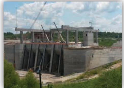
Luhr Bros. working on the channel construction at the Smithland Hydro Dam.

The work in District five is expected to remain strong this year and next. We strongly encourage all members to take advantage of the training sites in the winter months to upgrade skills and obtain