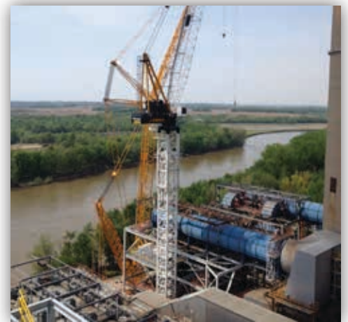
Local 181 members manning the rigs at IP&L in Petersburg, IN.