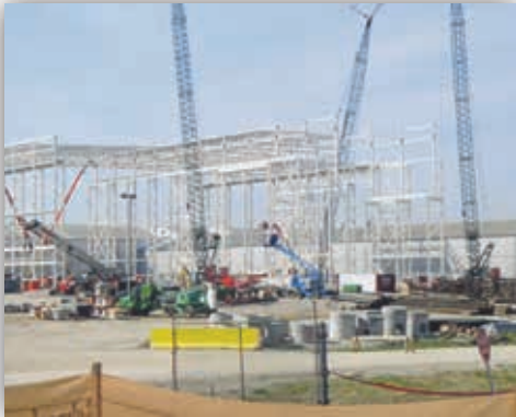
Midwest Steel at the Aleris expansion in Hancock Co. Kentucky

In closing, District One wants to encourage each member to get out and vote this November. We can't begin to tell you the importance of putting labor friendly candidates in office. ♦