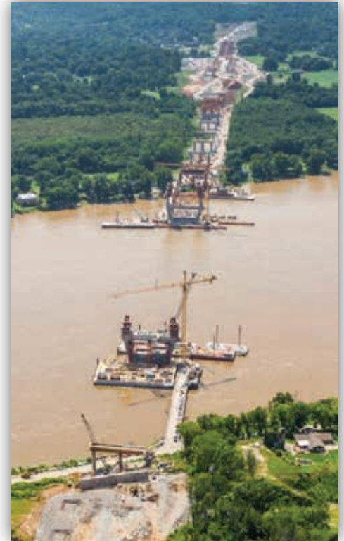
Walsh-Vinci on the East End Bridge project.

with only one floor to go. Whittenberg Construction is working at North American Stainless on a building addition in Carroll County, the student housing at University of Louisville, and nearing completion at A-Loft Apartments. Huelsman & Sweeney continues erecting the main brew processing structure at Diageo Distillery with crane assistance from Padgett and Bower. Shain Steel is doing steel erection on the new Ft. Knox Elementary as well as an addition at North Hardin High School in Elizabethtown.