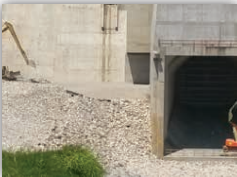
Morsey Constructors and Barnard Construction at the Smithland Hydro Dam.

In closing, if we can be of assistance to any member, do not hesitate to call our office at (270) 443-7766. ♦