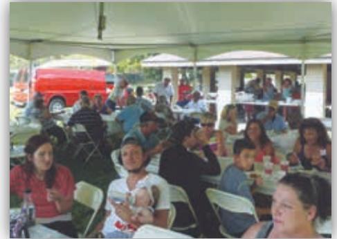
Labor Day Picnic at Fort Boonesborough

In closing we want to encourage all Members to attend our District meetings held at 7:00 P.M. at the Lexington Office located at 121 Cherrybark Drive in Lexington, KY on the first Tuesday of each month except in June and December. If we can be of any assistance please stop by or call us at 859-278-8458. ♦