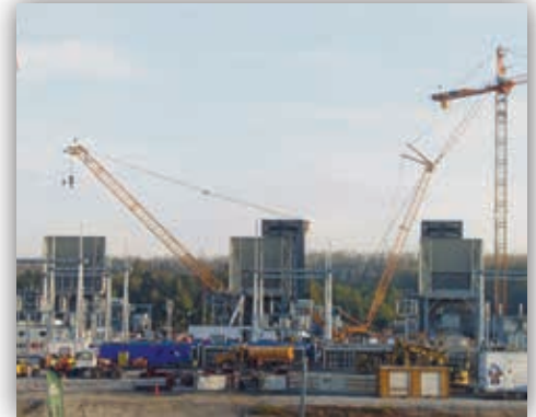
Kiewit Power at TVA Combined Cycle Plant.